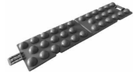
TYP 5 – with plug in coupling