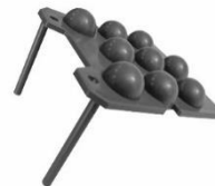
TYP 4 – small with hooks 44mm