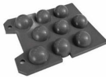
TYP 3 – small