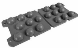
TYP 2 – big and separable, also angled usable

Free of halogen-containing compounds, azo dyes, flame retardants.